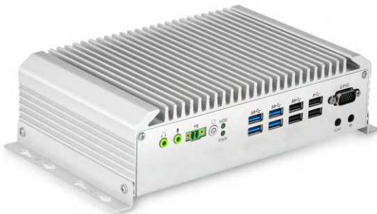
(All photos here are for reference only, Specifications are subject to the physical product.)